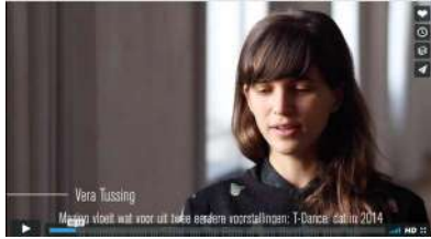
Mazing / Interview 3:38 https://vimeo.com/191618953