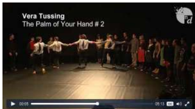
The Palm of Your Hand 5:13 https://www.numeridanse.tv/fr/video/4906-the-palm-of-your-hand-2