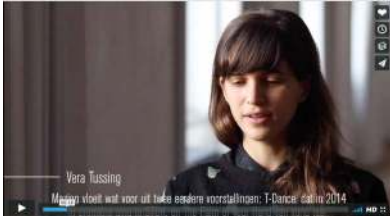
Mazing / Interview 3:38 https://vimeo.com/191618953