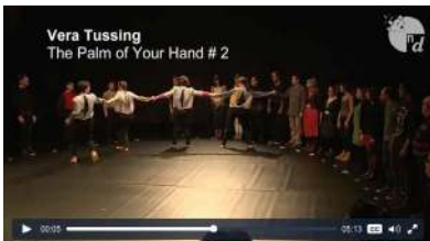
The Palm of Your Hand 5:13 https://www.numeridanse.tv/fr/video/4906-the-palm-of-your-hand-2